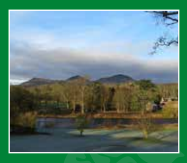
From St Boswells, the route follows the River Tweed, along the edge of the Golf Course, towards and over Mertoun Bridge (B6404), then along Benrig Haugh, through the woods and up Jacob's ladder to Benrig Cemetery and the site of the old church.