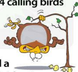
and a partridge in a pear tree