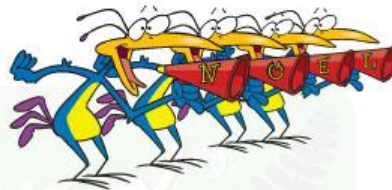
4 calling birds