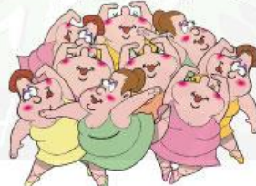
9 ladies dancing