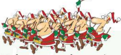
12 drummers drumming

On the twelfth day of Christmas my true love gave to me: