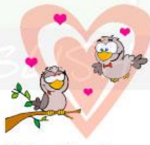
2 turtle doves