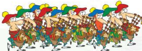
11 pipers piping