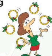
5 golden rings