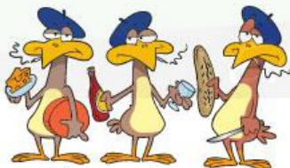
3 French hens