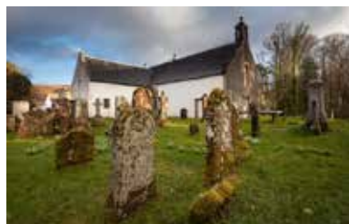
Kilfinnan Chapel, one of the sites on the Faith in Cowal pilgrim network.